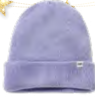
Jack Wills £14.99