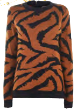
Biba @ House of Fraser £12