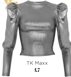
TK Maxx £7