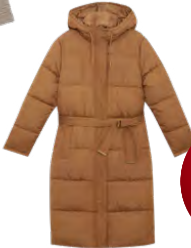
New Look £59.99