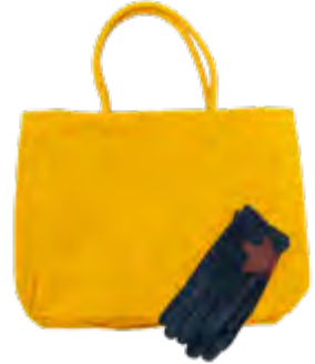
Willow & Nutmeg £13