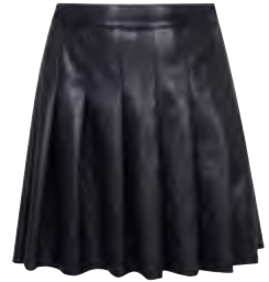
New Look £39.99