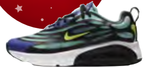
Nike @ Sports Direct £52

Add a splash of colour with your accessories - the bolder the better!